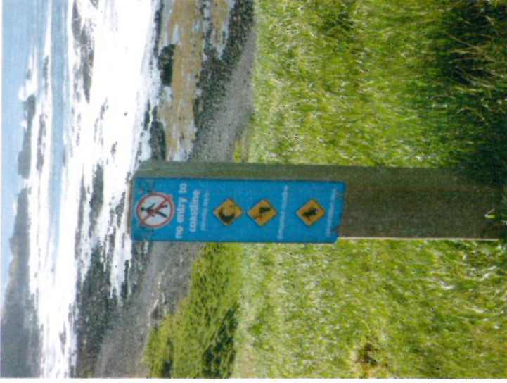
(In accordance with the National Aquatic and Recreational Signage Manual)