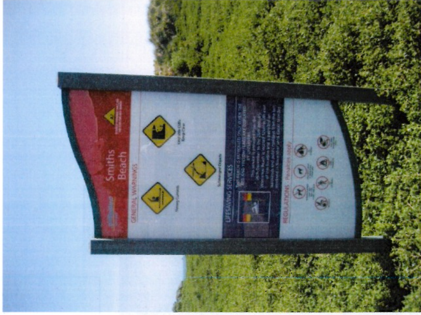
(In accordance with the National Aquatic and Recreational Signage Manual)