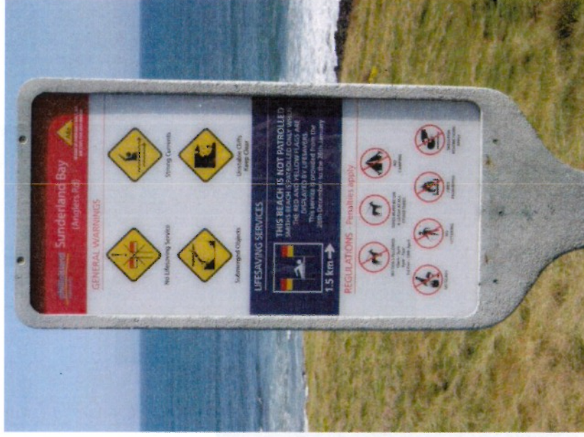
(In accordance with the National Aquatic and Recreational Signage Manual)